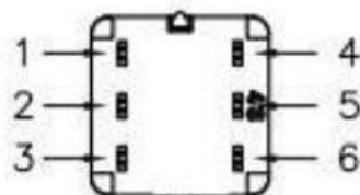
view A scale 1:1